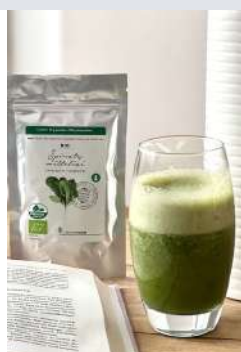
SPINACH POWDER Organic PACK: 100 G / 1 KG / 25 KG