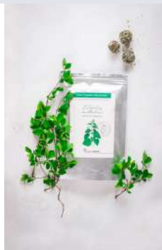
NETTLE POWDER Organic & Conventional PACK: 50 G / 1 KG / 25 KG