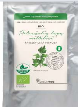
PARSLEY LEAF POWDER Organic & Conventional PACK: 50 G / 1 KG / 25 KG