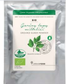
GROUND ELDER LEAF POWDER Organic & Conventional PACK: 50 G / 1 KG / 25 KG