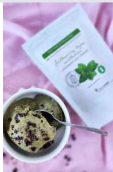
SPEARMINT POWDER Organic & Conventional PACK: 50 G / 1 KG / 25 KG