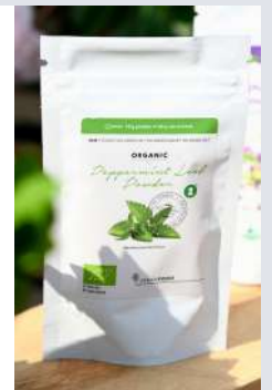
PEPPERMINT POWDER Organic & Conventional PACK: 50 G / 1 KG / 25 KG