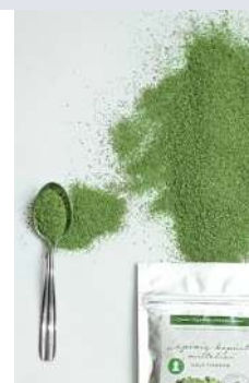
KALE POWDER Organic & Conventional PACK: 50 G / 1 KG / 25 KG