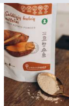
SWEET POTATO POWDER Organic & Conventional PACK: 100 G / 1 KG / 25 KG