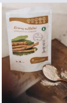
HORSERADISH POWDER Conventional PACK: 50 G / 1 KG / 25 KG