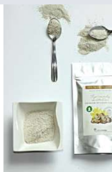
JERUSALEM ARTICHOKE (TOPINAMBUR) POWDER Organic & Conventional PACK: 100 G / 1 KG / 25 KG