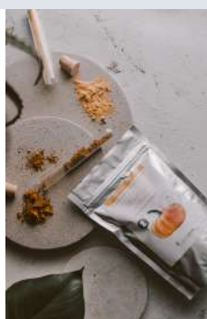
PUMPKIN POWDER Conventional PACK: 100 G / 1 KG / 25 KG