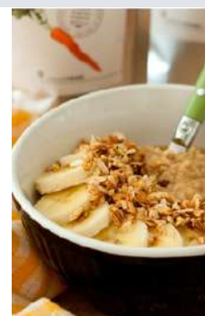
CARROT POWDER Organic & Conventional PACK: 100 G / 1 KG / 25 KG