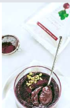
BEETROOT POWDER Organic & Conventional PACK: 100 G / 1 KG / 25 KG