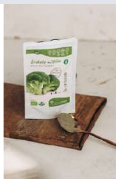
BROCCOLI POWDER Organic PACK: 50 G / 1 KG / 25 KG