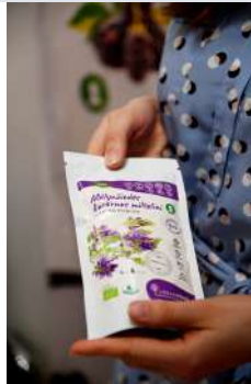
ALFALFA POWDER Organic & Conventional PACK: 100 G / 1 KG / 25 KG