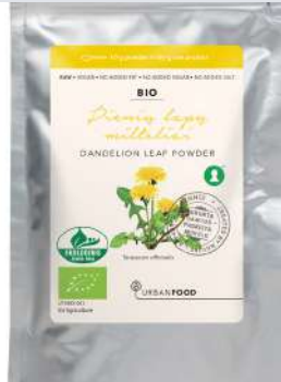
DANDELION LEAF POWDER Organic & Conventional PACK: 50 G / 1 KG / 25 KG